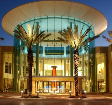
Mall at Millenia (Orlando, FL)