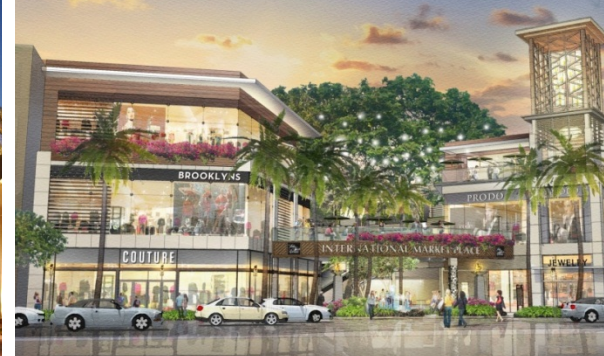
International Market Place (Honolulu, HI)